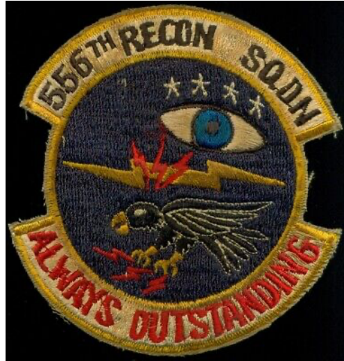
556 Reconnaissance Squadron emblem: approved, 14 Aug 1969