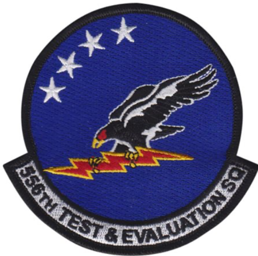
556 Test and Evaluation Squadron patch