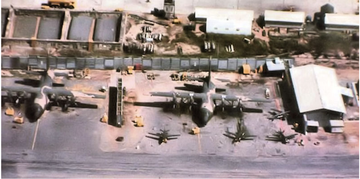
556 Reconnaissance Squadron revetments at Bien Hoa AB, South Vietnam. C-130s and AQM-34 drones visible