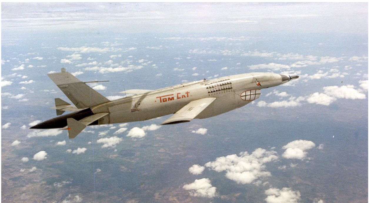
556 Reconnaissance Squadron AQM-34L Compass Bin drone